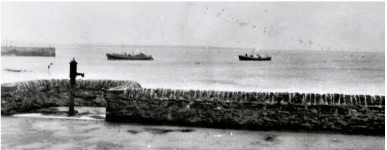
The Edward Z Dresden lies at anchor as her replacement, the newly built John Gellatly Hyndman, approached the harbour on her maiden voyage from Cowes in the Isle of Wight, where she was built, to Stronsay