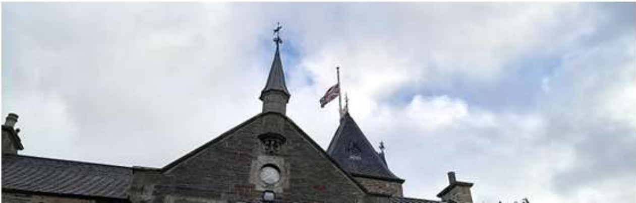
The Union Flag flies at half-mast over the Council Offices on the day of the funeral of HRH The Duchess of Kent.

A report from your "shortlisted" councillor.