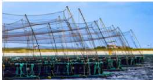
Bay of Holland Atlantic Salmon Farm, Stronsay

Community The Cooke Community Benefit Fund has regularly sponsored the Massive Weekend event, and provided laptops for Stronsay Junior High School to ensure every student had access to their own device. Cooke further supplied funding for defibrillators on the isle, and aided Stronsay Community Association with a significant financial donation to help build a new hall extension on the Stronsay Hall .