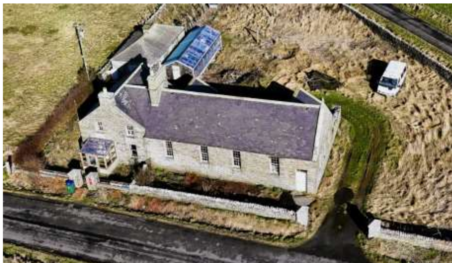
The South School and Schoolhouse as it is today, showing signs of neglect but still structurally sound almost 150 years after it was built.

On 11 th October 1876, little more than a year after funding had been agreed, it was reported that the building and furnishing of the South School was finished and, following an inspection, the Board agreed that it was satisfactory and assumed its control.