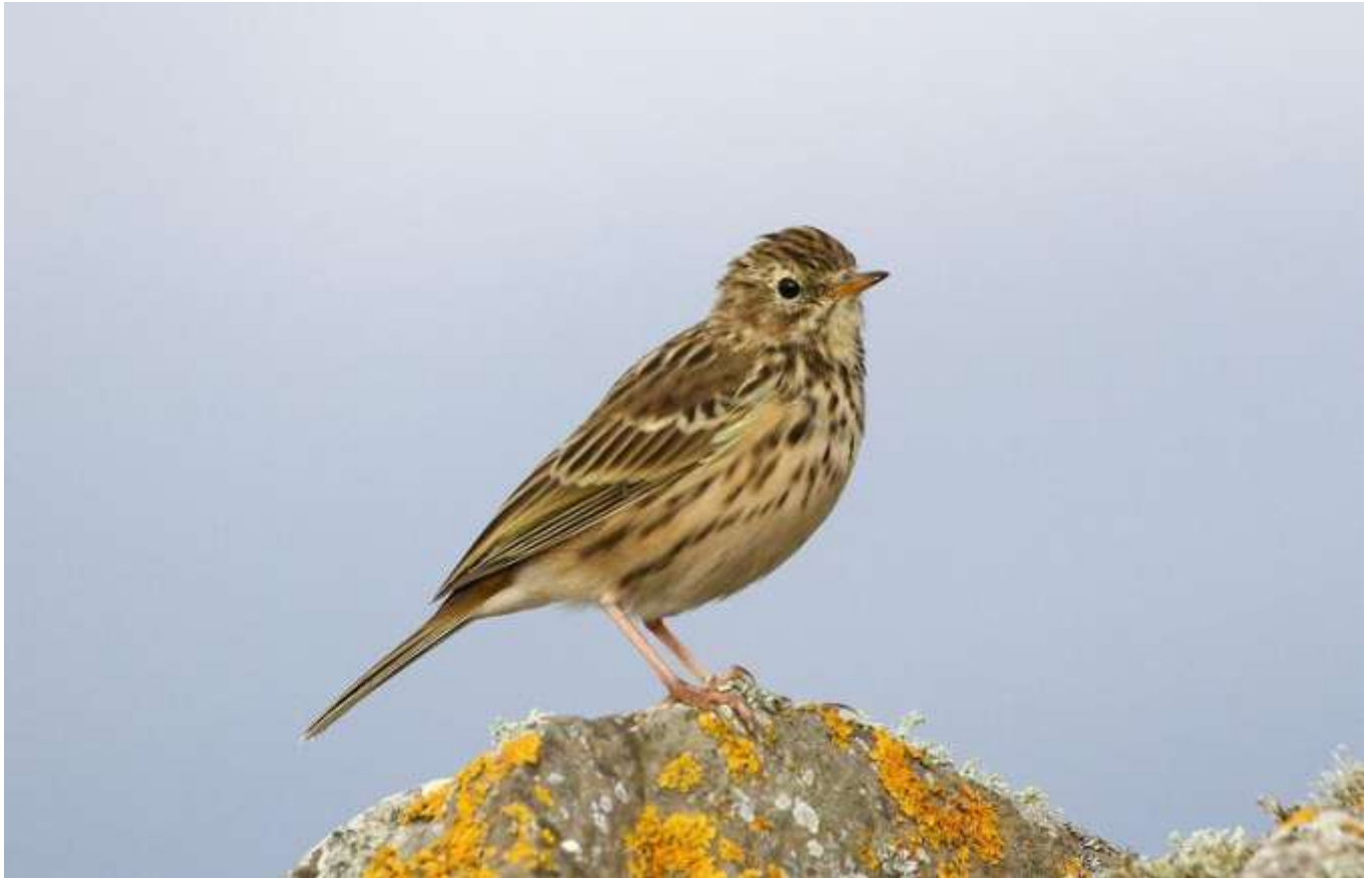
Meadow Pipit - now returning to their breeding sites on the island