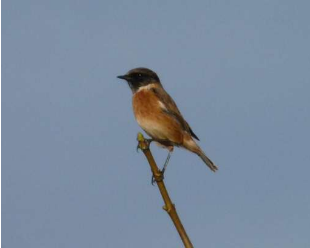
Male Stonechat with black head and bright rufous body. None recorded so far this year, but worth looking out for along the roadside fences in early Spring