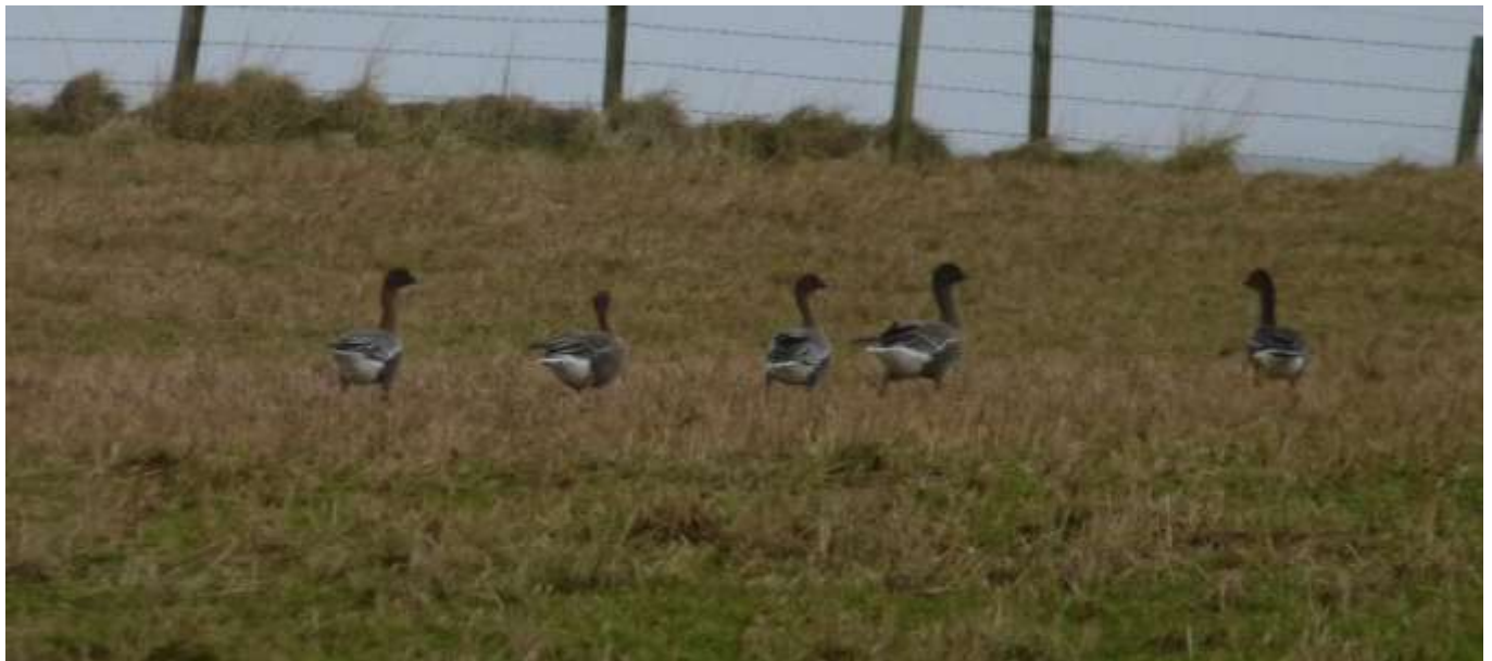
Bean Geese at Boondatoon - darker-necked and somewhat smaller than Greylags