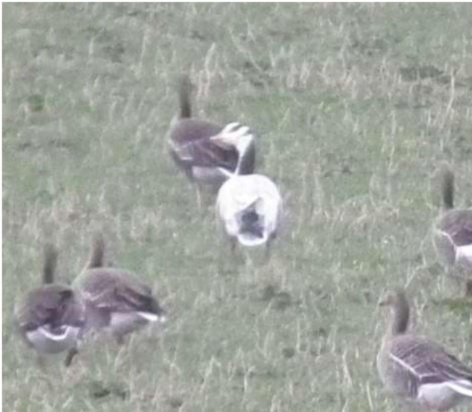
The Bar-headed Goose among Greylags at Huip.