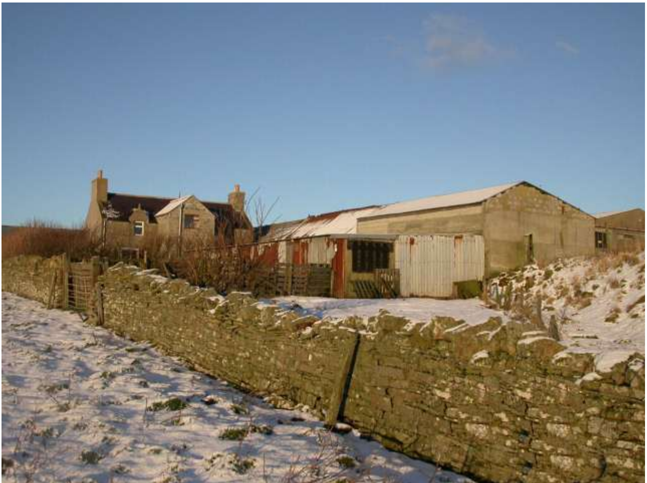
Clestrain Farm 2005