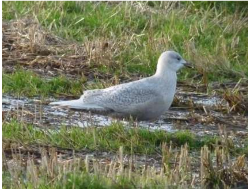
1st Winter Iceland Gull, Jan. 2012