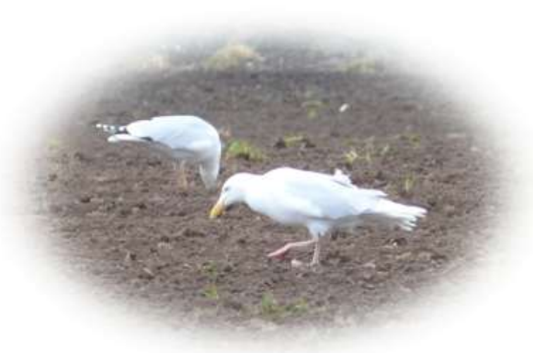
Adult Glaucous Gull (rt.), Spring 2008 note large size and heavy bill. (Herring Gull to right)

Small parties of Fieldfares and a few Redwings were still present in mid-Winter and these were boosted by a considerable influx of thrushes at the start of the fine, calm weather on 14th January. At least 500 Fieldfares were seen after this date and there was an interesting flock of 6 Song Thrushes near Holin Cottage on 16th. Single Greenfinch, Siskin, and 2 Chaffinches have been seen and a Dunnock which arrived in the Castle garden may have been the bird which had been over-wintering at Helmsley where a big area of the preferred habitat of this species was sadly destroyed in the mid-Winter storms.