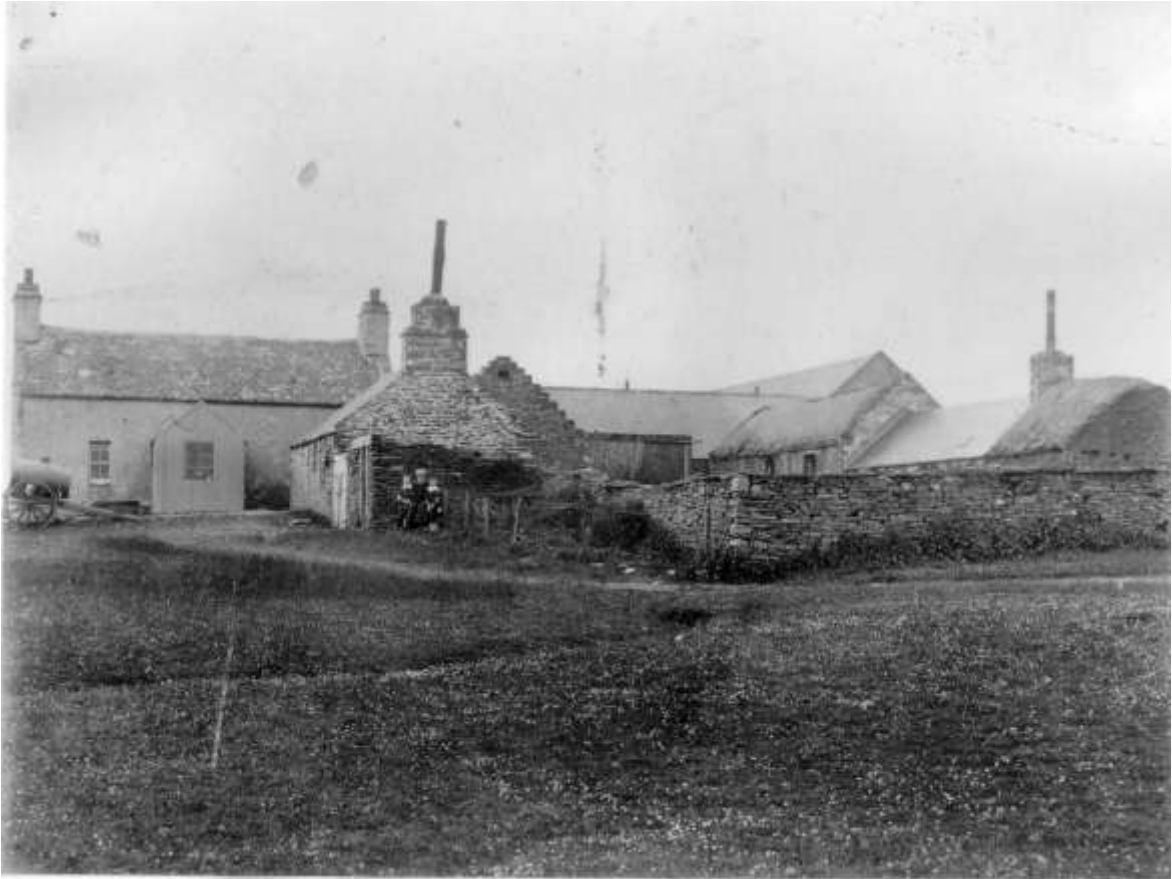
Clestrain Farm circa 1930