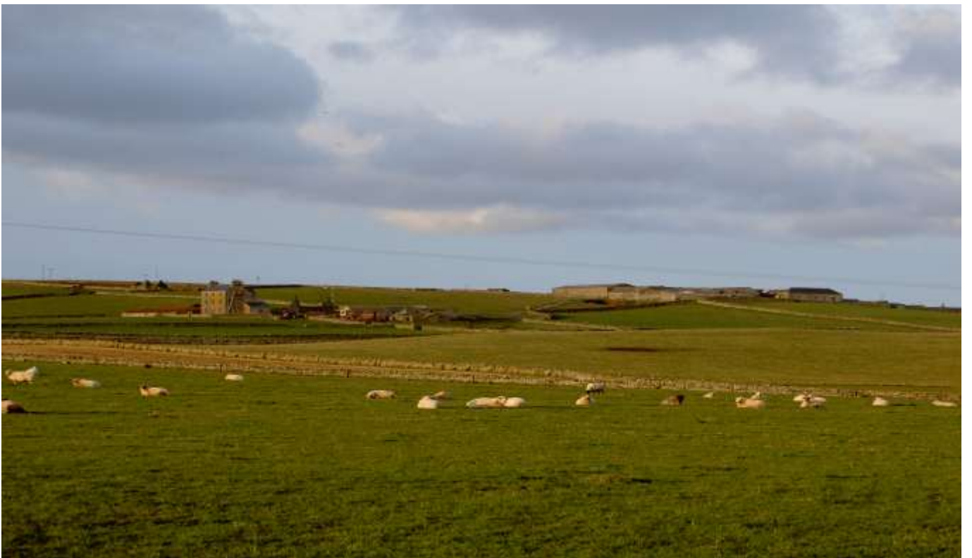
The Manse & Whitehall area 2012