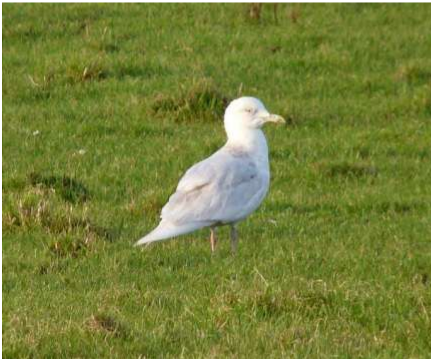
Adult Iceland Gull, Jan. 2012

The name Iceland Gull is a misnomer as the birds originate mainly from Greenland and Arctic Canada - but do not breed in Iceland! Glaucous Gulls (which do breed in Iceland) are very similar to Iceland Gull in all plumages but are generally noticeably bigger (Great Black-backed Gull size) and 'uglier', with a 'fierce' expression and a longer, heavier bill. (see photos - all taken on Stronsay)