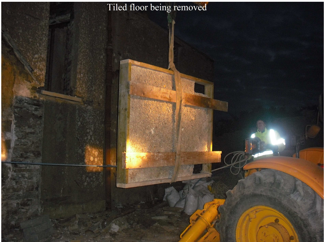
Tiled floor being removed