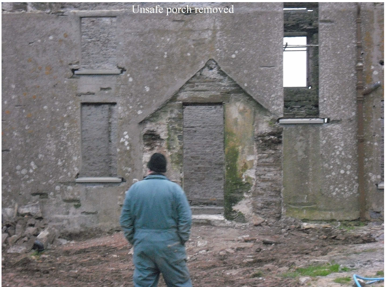
Unsafe porch removed