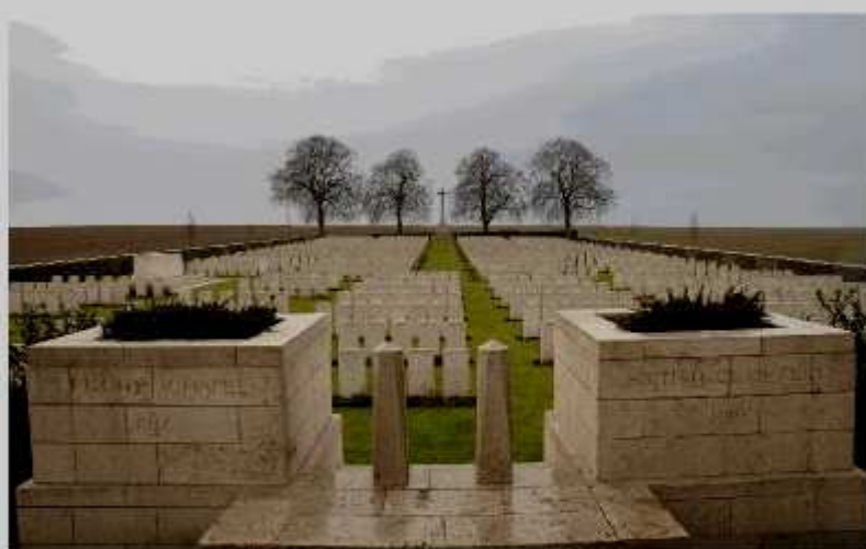
Feuchy Chapel British Cemetery, Walcourt, France.