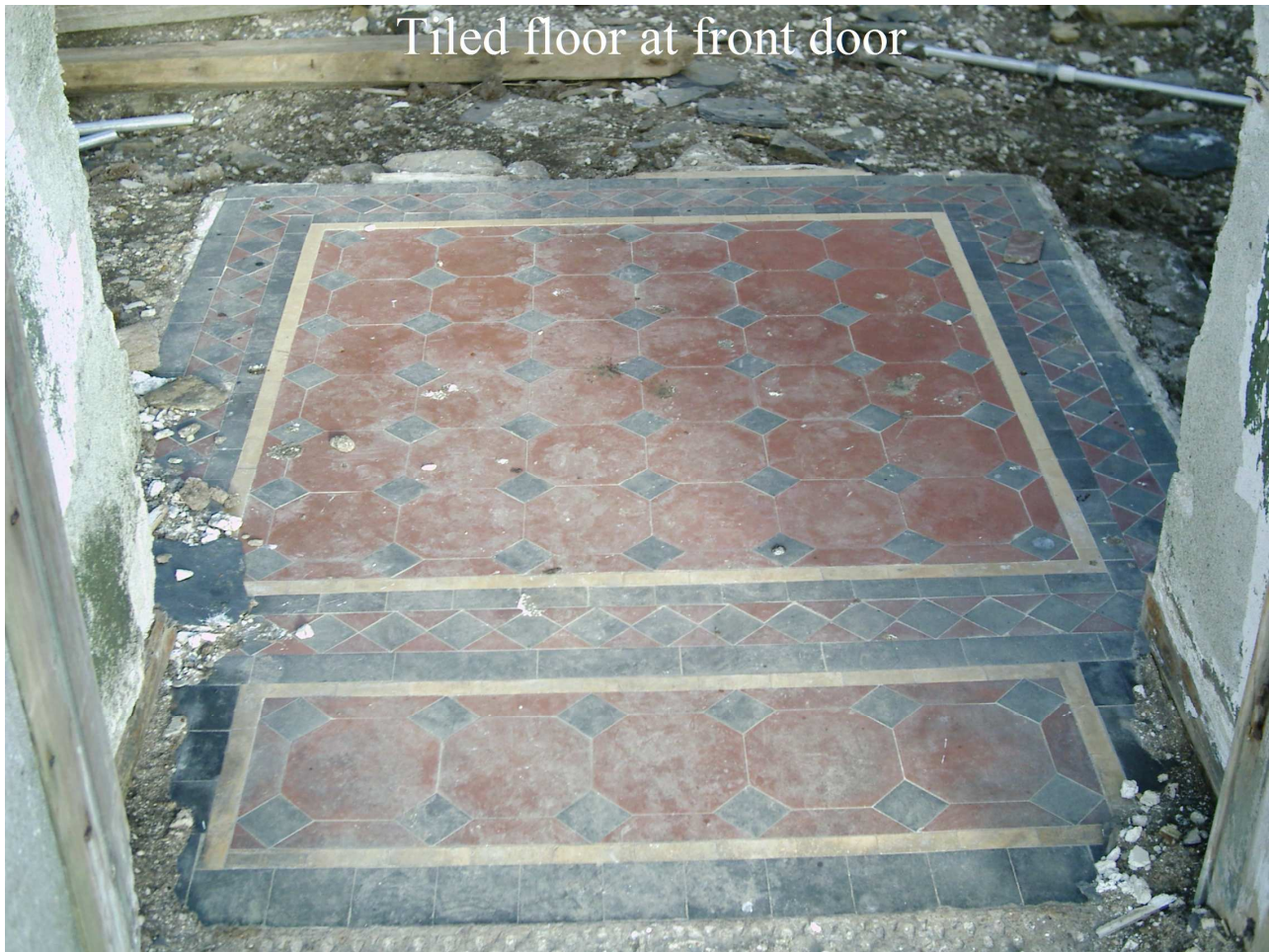
Tiled floor at front door