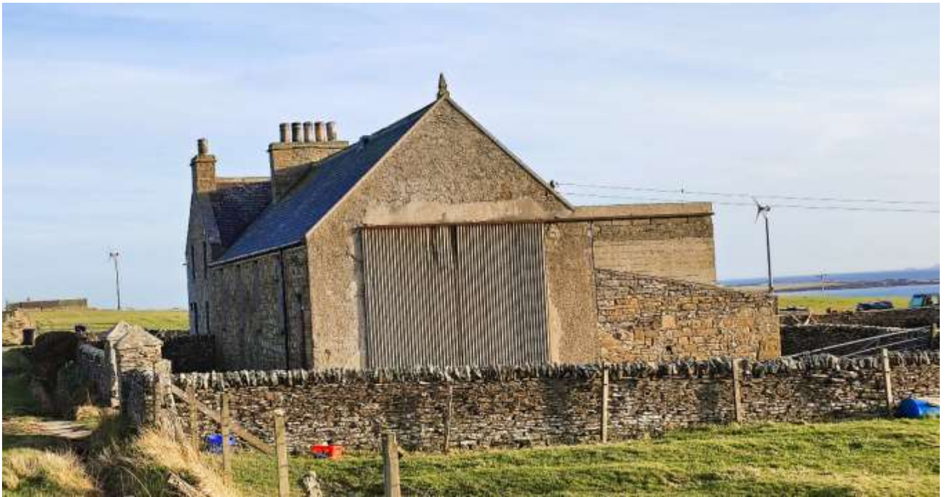
The school building as it is today, showing the large 'combine harvester-size' door which was made in the gable end of the building.