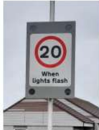
Part-time 20mph speed limit outside an Orkney island school in 2024

At this juncture, I would like to take the opportunity to quash the fake news that has been circulating in the Isles that agricultural vehicles are not permitted to drive through permanent 20mph zones. This is completely untrue. The only restriction applying to agricultural vehicles in 20mph zones is that their speed must not exceed 20mph, the same restriction that applies to any other vehicle. I request the originator of this rumour please to desist from spreading misinformation which only serves to undermine safety for everyone on our island roads.