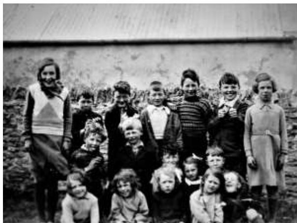
Pupils at the North School in 1937

The hopes for a new school in the vicinity of Whitehall Village never materialised and it was to be a further 13 years before school meals became a reality.