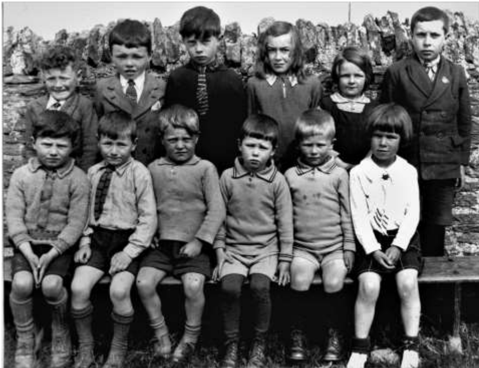
North School pupils from around 1935. Names are:

A school photo from around the time of her appointment shows most of the pupils who would have been at the school at that time, the majority of whom seem to be none too excited about having their photo taken!