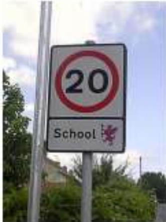
Permanent 20mph speed limit outside an English village school in 2015

You have probably noticed that the part-time, light-controlled 20mph speed limit signage around Isles schools has been removed. This was necessary for safety reasons owing to significant defects having been identified with the supporting poles. In order to maintain road safety, a road traffic regulation order was issued in The Orcadian of 5 th March to temporarily implement permanent 20mph speed limits in these areas. As I made clear from the very start of my campaign for Isles children to be afforded the same road safety standards around their schools as children elsewhere, I prefer permanent limits (as in the left-hand photo) over part-time ones (as in the right-hand photo), so I hope these will be retained in the long-term.