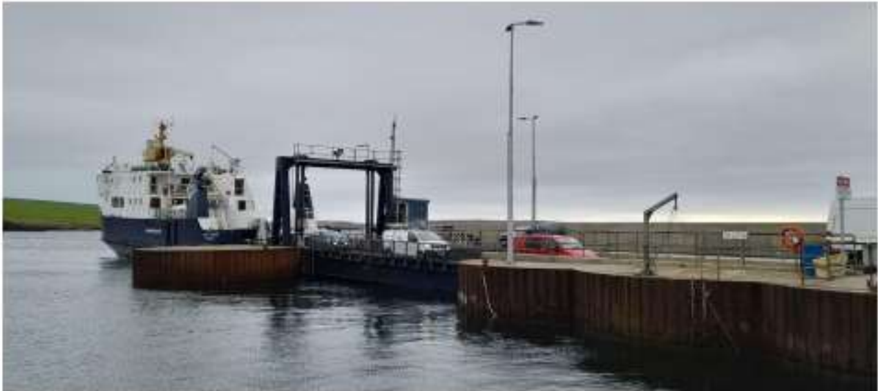
MV Earl Sigurd at Rapness

—connecting with constituents of the North Isles ward.