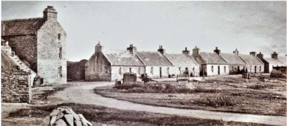
Some of the fishermen's cottages in the Lower Station in the early 1900s

During the next few years the John Ryburn was called out to assist ships in distress on 11 separate occasions. Perhaps the best known of these was when, in the early hours of 10 th February 1912, she was called out to go to the assistance of the Aberdeen steam fishing boat 'Crimond', ashore on the Holms of Ire off Sanday's north coast. It was a night of poor visibility, with the wind in the south-east and a heavy sea running but the lifeboat covered the fifteen miles in just over two hours with little to guide her passage other than the waves to be seen breaking white along the Sanday shore. Before the lifeboat's arrival, five of the Crimond's nine-man crew had attempted to gain the safety of the shore in the ship's small boat but it had been swamped by the heavy seas and only one managed to scramble ashore alive. In darkness near to low water on a rocky coast the John Ryburn had no option but to lay off for a time but, with the first glimmers of daylight and a flood tide, and at some considerable danger to lifeboat and crew, the coxswain attempted a rescue. He managed to manoeuvre the John Ryburn alongside the stricken ship long enough to get the Crimond's four remaining crew safely aboard the lifeboat before carrying them back to the safety of the Stronsay harbour.