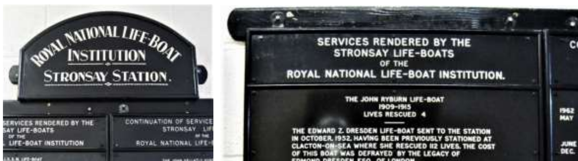
Part of the 'Records of Service' boards displayed in the Community Centre where only a few brief lines are devoted to the six years of service of the John Ryburn.

There are other reminders of this heritage though, not so visible to the casual observer, and what must surely be the most important of these are the black RNLi 'Records of Service' boards. These were originally kept on display in the window of the 'Lifeboat Hoose' (later renamed Cardinham House) but are now housed proudly and prominently inside the Community Centre. They provide a lasting record of the services rendered by the Lifeboats which have been based in Stronsay and served the North Isles of Orkney so diligently over the years, although only brief mention is made of the service provided by the John Ryburn.