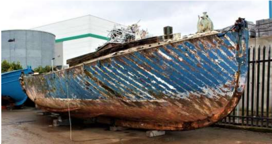
The John Ryburn in a rather sorry condition in 2014

No more is heard of her until, in April 2014, the Thames Ironworks Heritage Trust (it was at the Thames Ironworks Boatyard that the John Ryburn had been built more than a hundred years earlier) bought her in a sorry condition with a view to renovating her. I've been unable to find any more details about her and whether the renovation was successful but can only hope that she has been restored to something of her former glory.