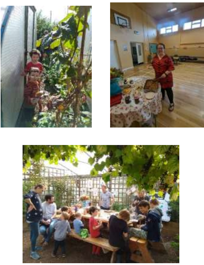
November Nature Art Workshops

Similar community activities were taking place across Scotland on 9<sup>th</sup> and 10<sup>th</sup> September, bringing together people, nature and growing. It was great to put Stronsay on the map as part of this national celebration of communities.