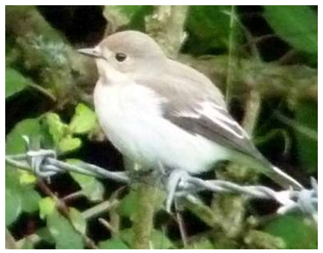
Pied Flycatcher - Holin Cottage.