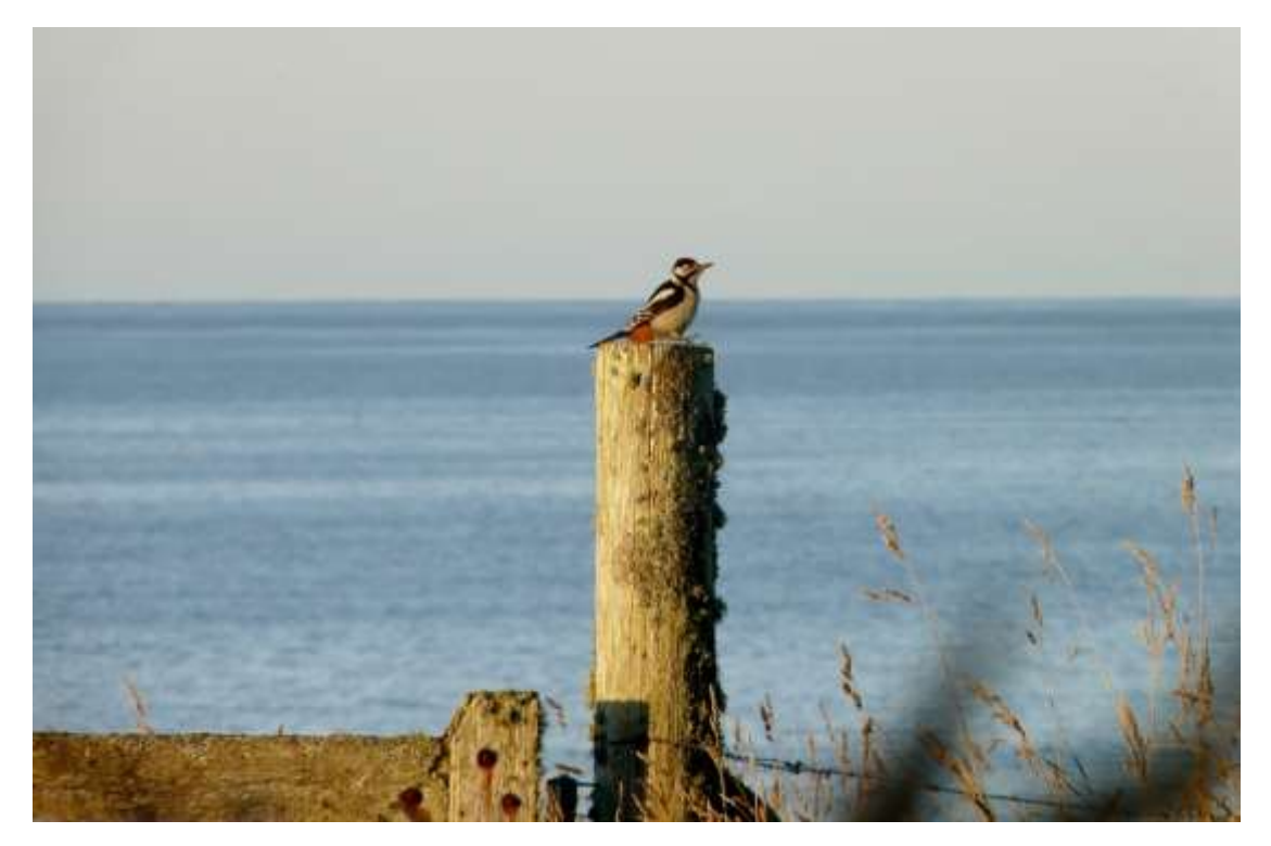
Great Spotted Woodpecker – Castle - not a tree in sight!