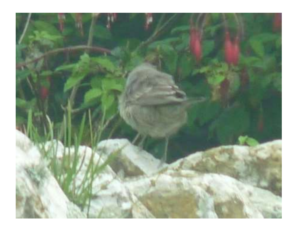
Barred Warbler – Airy garden wall – 'skulking' as usual!