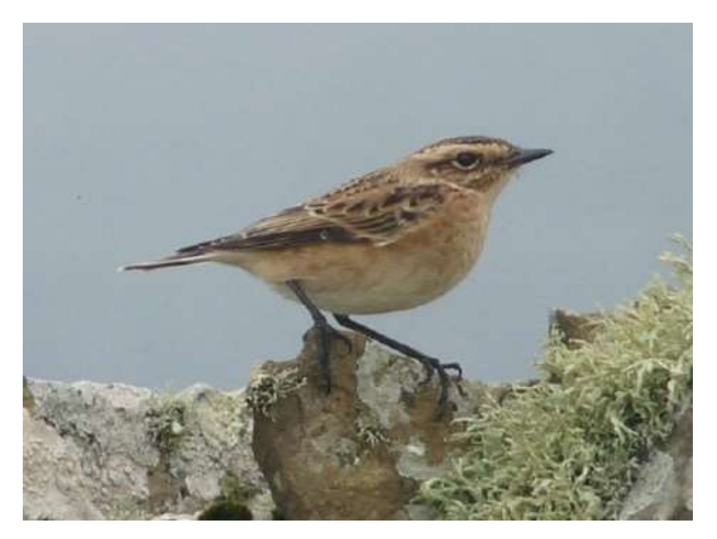
Whinchat by the roadside – Islesview 'corner'.