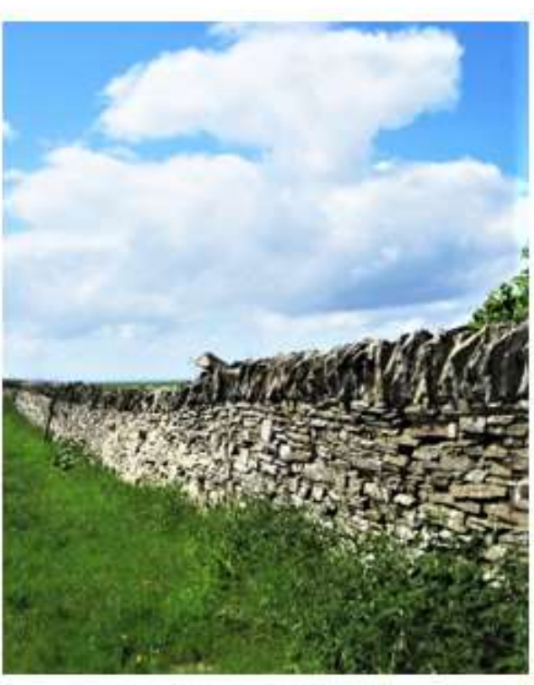
Part of the 'March Dyke' boundary between Housebay and Holland.

With the land now being well fed and better cultivated, the benefits were soon evident, with crops of turnips in particular noted as being second to none - and Housebay was now regularly growing 150 acres of them each year! Cereal crops too were profiting from these improvements, with better quality and higher yields of both straw and grain soon apparent in the bere and oat crops being grown. All the turnips and straw, along with some of the grain, was utilised for the livestock over the winter, while some of the bere and oats were dried and ground into meal for human consumption, an allocation of this meal being an essential part of farm worker's pay at the time. Although self-sufficiency was the first priority, surplus grain was exported and proved to be a valuable source of additional income from the farm.