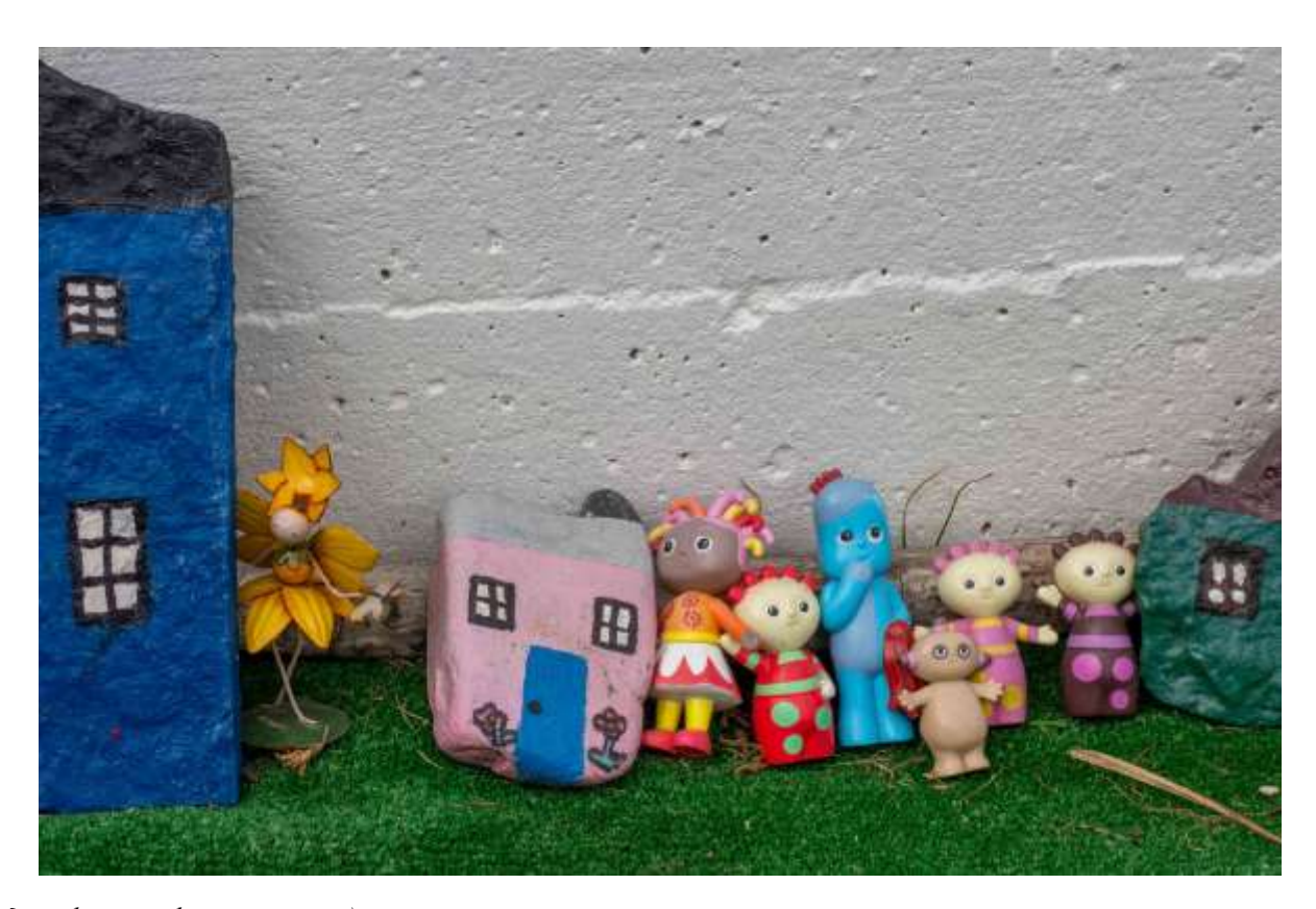
(More photographs on next page)