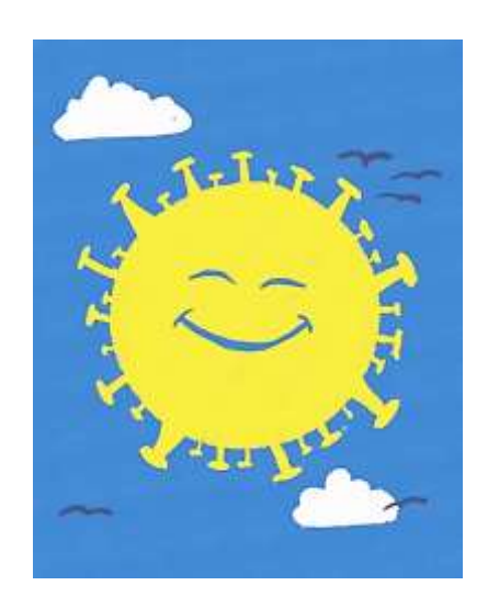
© MMXX Ælfleda Clackson, student at the Münster School of Design (www.aelfleda.com)

On 5<sup>th</sup> June, Orkney moved to COVID-19 Level 0. Despite its misleading name, Level 0 does not mean ZERO LEVEL! There are still restrictions, see: https://www.gov.scot/publications/coronavirus-covid-19-protection-levels/pages/protection-level-0/