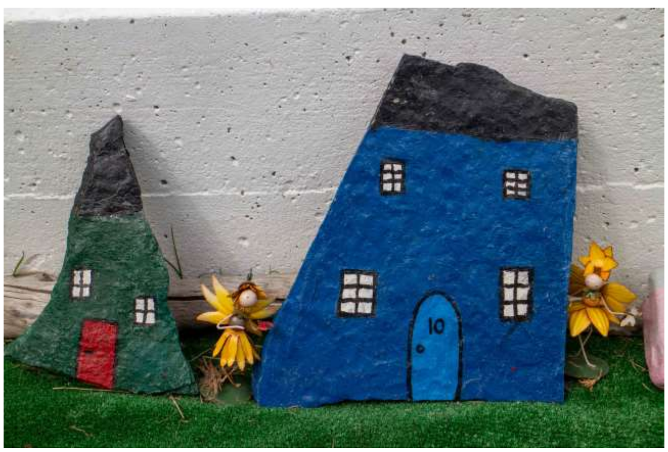
(More photographs on next page)