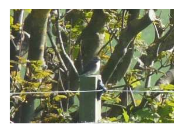
Female Red-backed Shrike – 100yds range along the Cleat Road.

One minus - there seem to be far fewer Pied Wagtails this year - or are we just missing them on our trips round the roads?