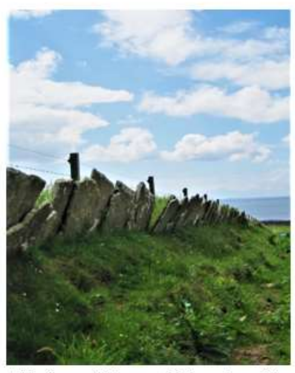
A flag fence, still in remarkably good condition after more than 150 years.

As time passed Robert continued, with the full backing of the owner, to plough out more of the rough pasture; Fields were squared off and enclosed by wire fences, drystone dykes or, in some cases, by 'flag fences' (large, flat stone slabs set into the ground on their edge to form a continuous boundary); ditches were dug, fields drained and new purpose-built 'offices' (the term at the time for the farm steading and farmhouse) constructed to replace the obsolete buildings and make for more efficient working.