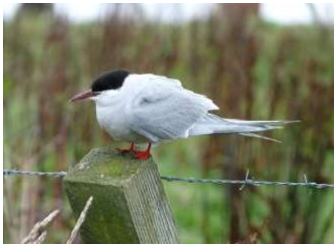
An unconcerned Arctic Tern next to the road in late September - photographed from the car at 6ft range. We were more surprised than the bird!