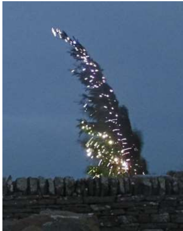
Stronsay's Christmas tree is buffeted by the recent high winds

Grimshaw (New resident of Brimskin's Home for the Pleasantly Deranged)