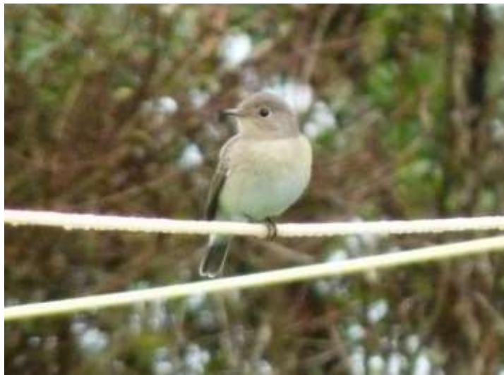
The flycatcher in The Manse garden in late September - still not specifically identified!