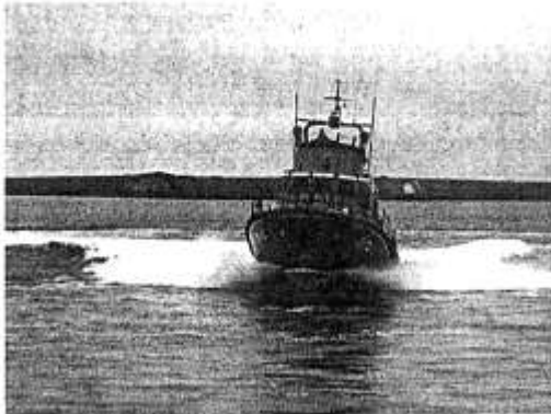
Left The 'Margaret Foster' Lifeboat arriving at Stronsay.